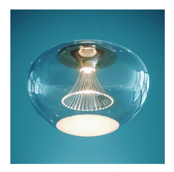
IP 20 (€ Dimmerable: +0 -